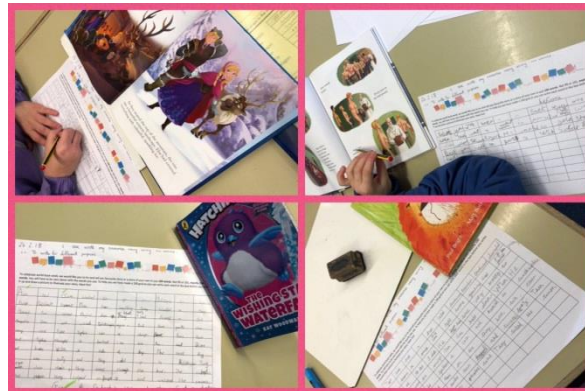
Story writing in Matisse