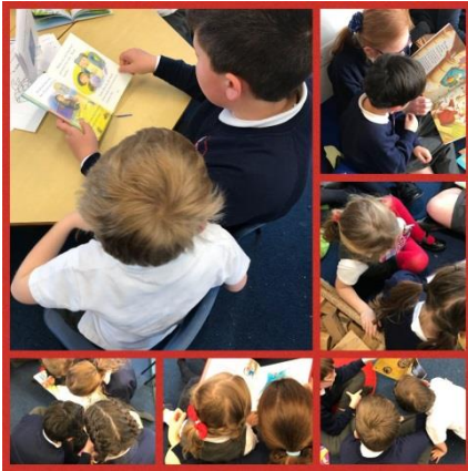
Paired reading – children sharing their favourite book with a buddy from another class.