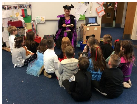
to listen to