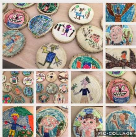
Art work linked to Billy and the Minpins in Gauguin